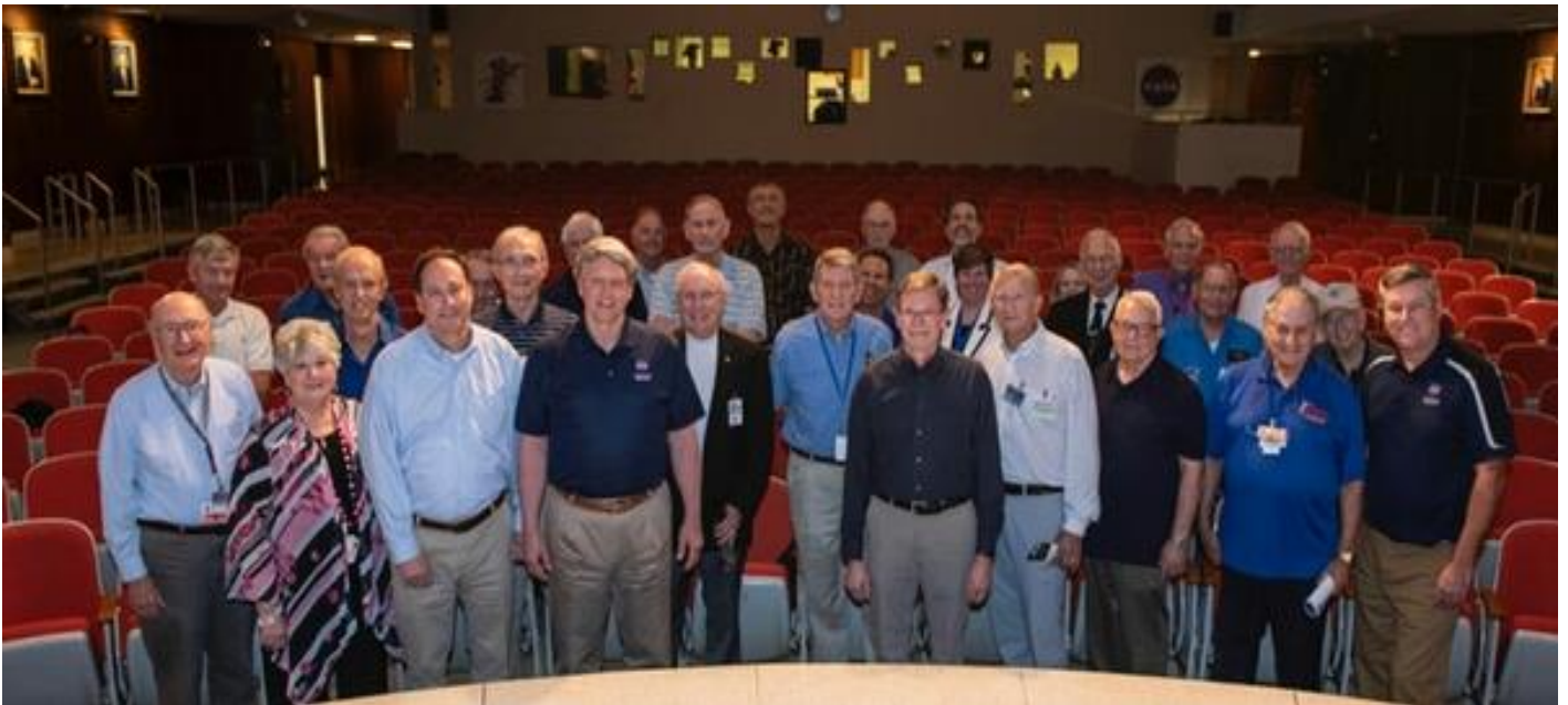
MRA attendees at Smoke and Fire Presentation