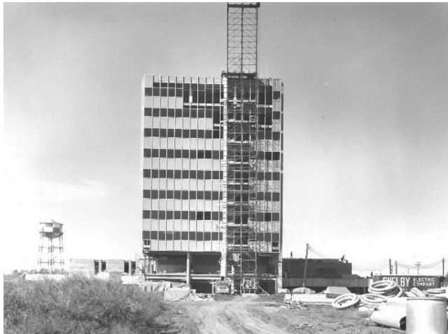
Construction of 4200