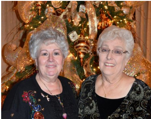
Secretary and Assistant Secretary